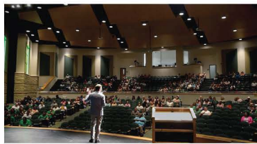
Cuero Independent School District

PROFESSIONAL DEVELOPMENT ★ TEACHER IN-SERVICE ★ BACK-TO-SCHOOL CONVOCATIONS