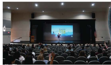
Winslow Unified School District