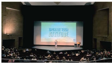
Murray Ridge Center